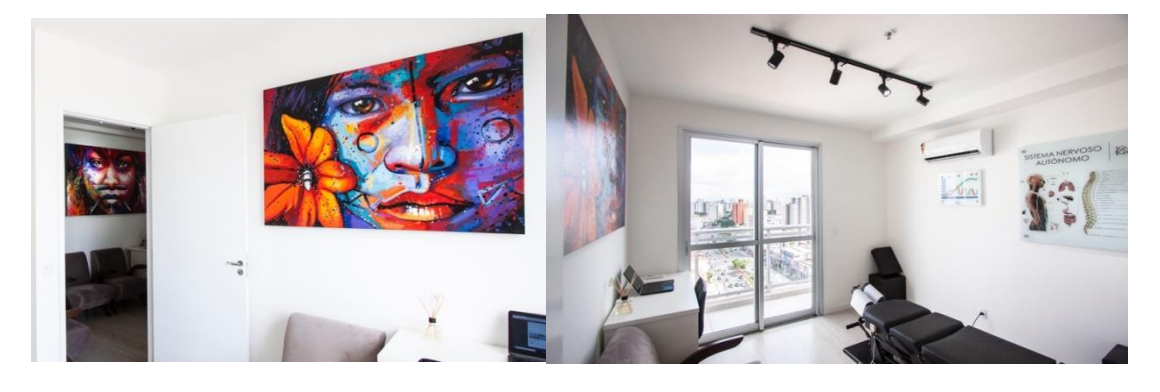
Figure 1- Clinical Dependencies

The clinic has a facility located in Paulista Avenue region and another in Vila Mariana region, both in the state capital, having made over 25,000 calls during this period. As a service differential, each consultation is accompanied by massage therapy (relaxing, aesthetic or therapeutic massage techniques), to enhance the effects of the procedures performed, totaling fifty minutes of care. Figure 1 illustrates part of its physical dependencies.