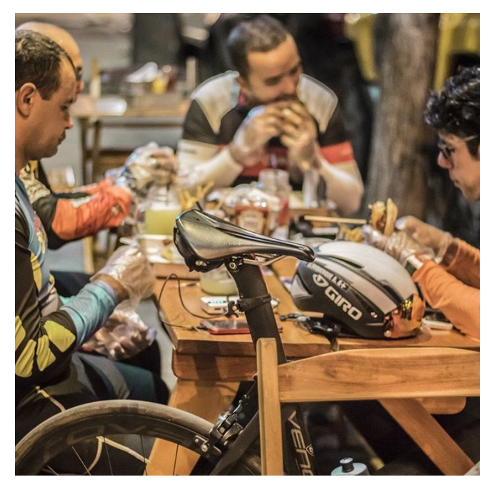
Pedal boats coming from Fortaleza to eat a Brick's