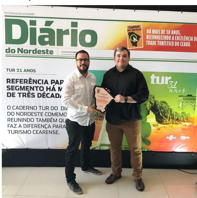
Fig. 06 Brick's members receive awards

Brick's success is such that at the end of 2017 the partners received, in its second year of operation and for the second consecutive year, the Sebrae 2017 Quality Seal (Figure 6). The award is the result of a joint action by Sebrae/CE and the trade state tourism, aiming to encourage the implementation of improvements in products and services offered in companies in the field of accommodation, food and events, working as an instrument to recognize the efforts of entrepreneurs who are providers of excellent and quality services in the tourism market. To achieve certification, companies go through an evaluation process, which involves the analysis of more than 200 items, such as the state of the physical facilities of the establishments, compliance with safety rules, storage and handling of food, the correct destination waste and good service practices, among other requirements.