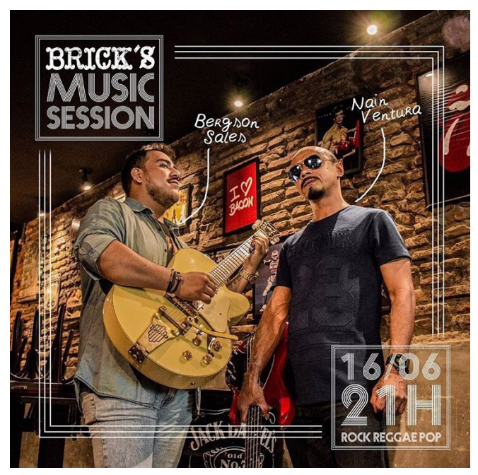
Brick's Music Session Announcement

a special city and being from Sobral is a pride. So the owners of Brick's paid homage to the Princess of the North (as the city is called), with what is most peculiar about it, creating a genuinely hamburger Sobralense. The name of the hamburger, Hallucination, was given in honor of Belchior, an artist from Sobral, and all the ingredients that make up the sandwich are also from Sobral, such as: crispy crackling flour made in the traditional Bar do Dermeval (one of the oldest bars in the city), baked coalho cheese produced by Lassa (dairy factory in Sobral, founded in 1969), crispy bacon caramelized with Guaraná Delrio (soft drink factory also in Sobral), special vinaigrette from Bar do Lulu (another traditional bar in the city), bread from Pão Mix (bakery also Sobralense and Brick's partner), handmade ketchup from Brick's and to drink a super cold Delrio. As expected, the sandwich was successful in the city and among customers.