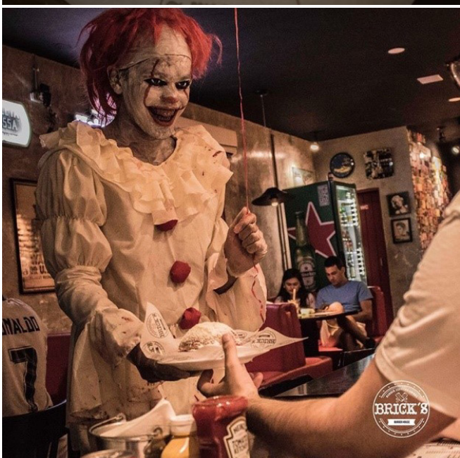
Dessert "A Thing"

The differentiated service, the environment with every detail designed to provide the Brick's experience, with songs that identify the place and entitled to a play list on Spotify, in addition to its own flavor, full of regionalism and without losing the characteristics of a "true hamburger", Make Brick's something desired by customers in Sobral, neighboring cities