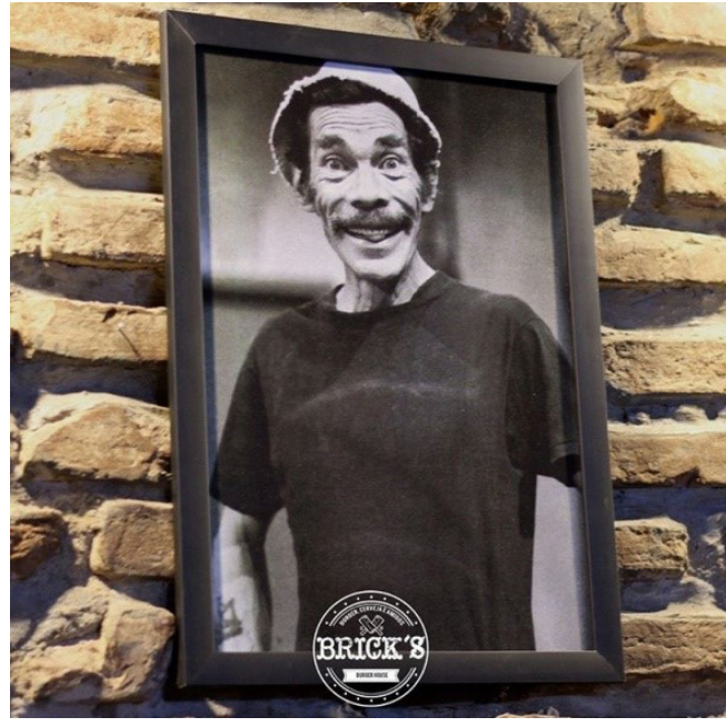
Character posters

So, here's an idea! At a point in front of Brick's, in June 2017, the partners open Brick's Express, a place where the customer can stop by and pick up their product to take home, place an order